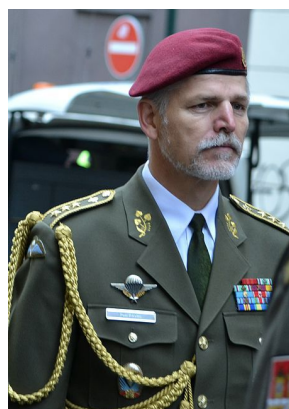
arm. gen. Ing. Petr Pavel, M.A. (b. 1961)

Military and Political Aspects of Current Threats