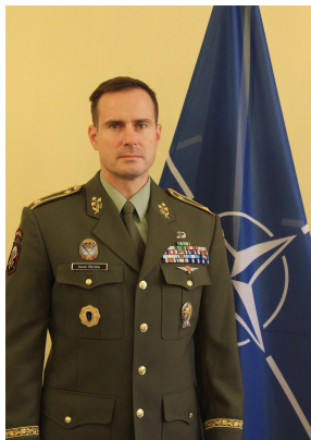
brig. gen. Ing. Karel Řehka (b. 1975)